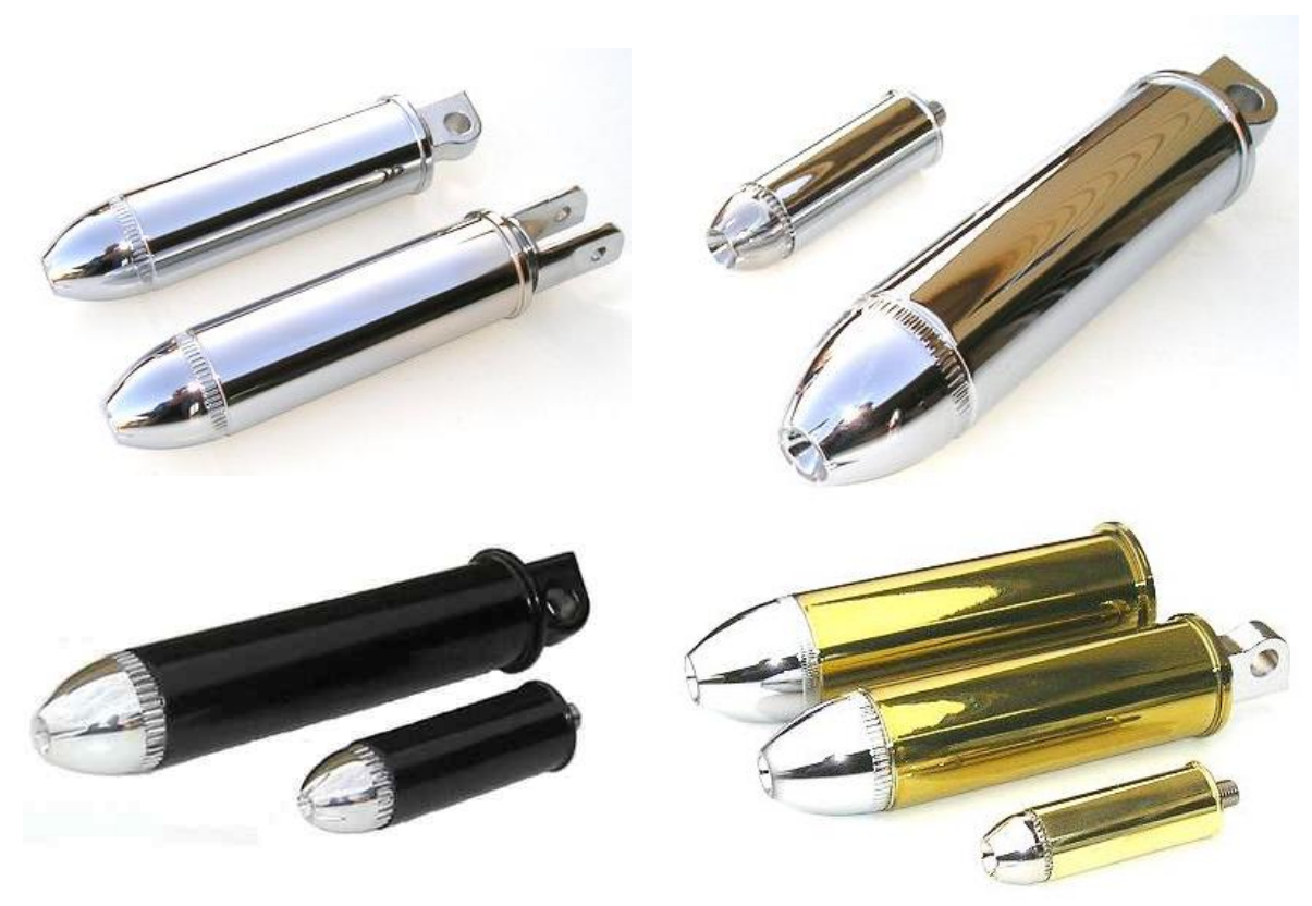
Matching grips, foot pegs & shifter pegs

These 44 MAGNUM foot pegs are milled from solid aluminum and match our 44 mag hand grips and shifter pegs. They come in polished aluminum, chrome or solid brass with chromed bullet tips. The foot pegs come with a variety of male or female mounts which fit Harleys, and most metric cruisers.(see fitment charts)