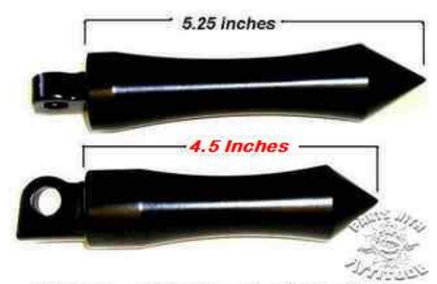
Mini Peg VS Standard Foot Peg

These MINI spike foot pegs are a great alternative to having full size pegs on the rear of your bike! They are ¾ of an inch shorter and a bit slimmer which really ads to an overall custom look. These are recommended for use if you only occasionally carry a passenger. The pegs are 4.5 inches and 1-1/8 inches in diameter (thickest part).