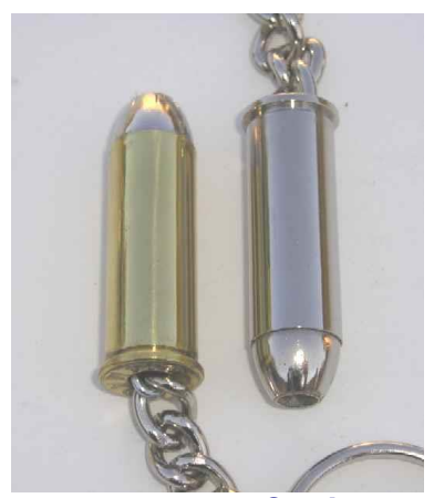
44 Mag & 9MM Key Chains