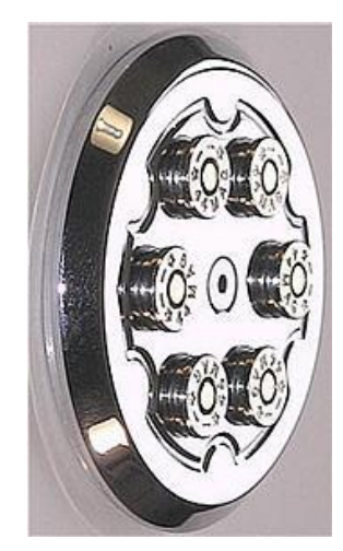
FITS ALL EVOs and TWIN CAM 88's.

These custom six shooter timing covers are made from billet aluminum and have a milled pattern of a revolver cylinder surrounding the bullets. The 44 magnum shells come in brass or nickel, and stand out from the cover about 1/10 of an inch for a very impressive look.