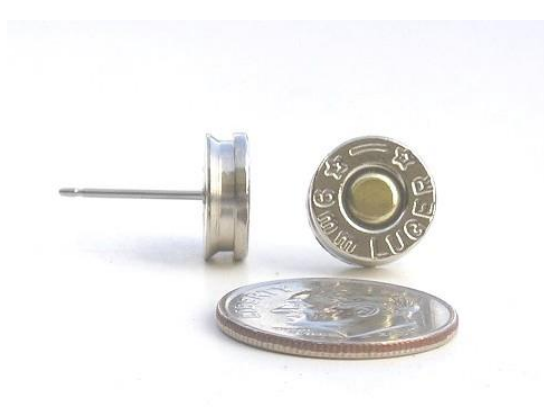
9MM Luger NICKEL