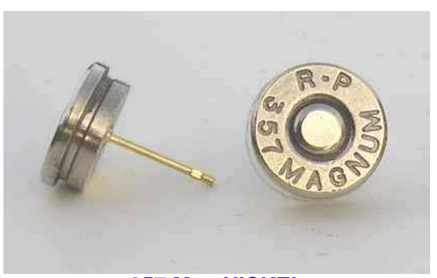
357 Mag NICKEL