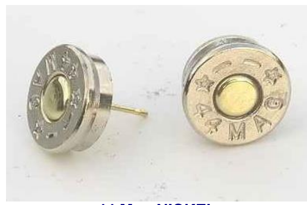
44 Mag NICKEL