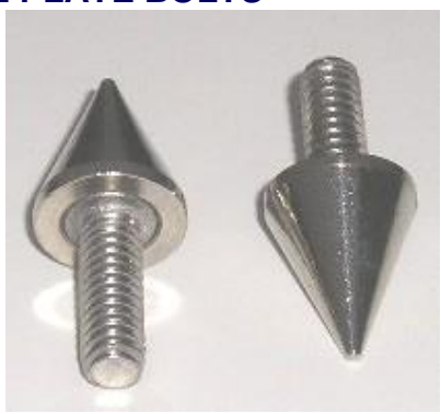
Low Profile Spikes