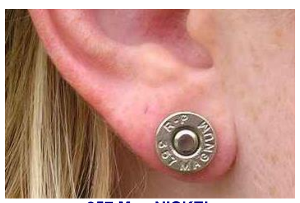
357 Mag NICKEL