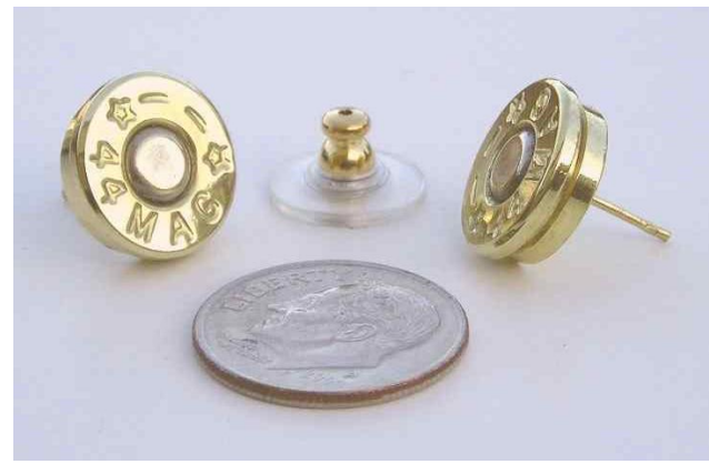
44 Mag BRASS